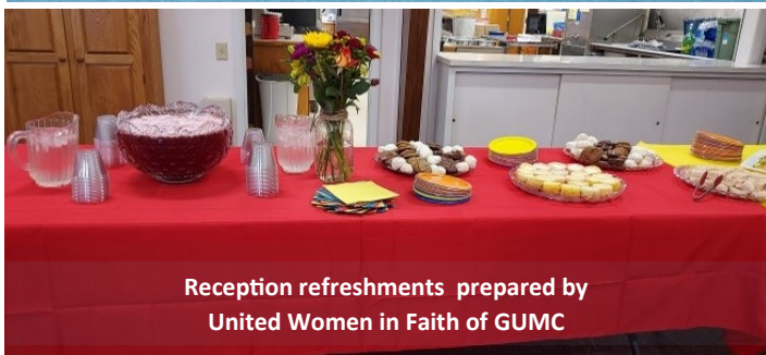
Reception refreshments prepared by United Women in Faith of GUMC

BP Trucking CCOR Home Care Company Galliford's AG Service Geneseo Chiropractic Geneseo Rotary Club Geneseo United Methodist Church Genesee Valley Florist Hildene Farms Howlett Farms Koch Orthodontics Oak Valley Inn and Suites One Stop Tech Shop Pickard Solutions Quinlan's Medical Supply Senior Care Connection Special Tees St. Michael's Episcopal Church Touch of Grayce United Women in Faith Wegmans